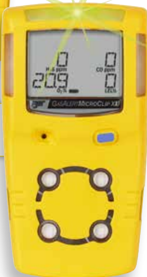
GasAlert MicroClip XL

NEW! GasAlertMicroClip X3 and GasAlertMicroClip XL now feature IP68 for maximum water and dust protection — up to 45 minutes at a depth of 1.2 m.