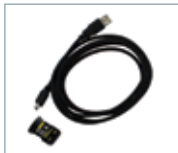
IR connectivity kit