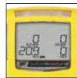
Easy to Read