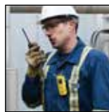
Easy To Wear