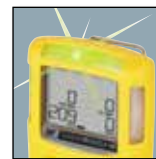
Easy to See