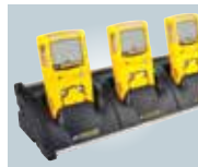
Five unit cradle charger

For a complete list of kits and accessories, please contact BW Technologies by Honeywell.